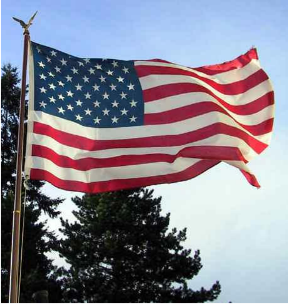
When a flag had draped a coffin. Of a brother or a friend.